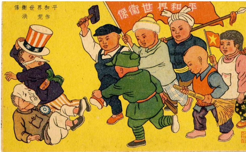
Figure 2: Hong Huang, Baowei shijie heping (Protect World Peace), ca. 1947. This is one of many artistic representations of children acting out huobaoju that were created during the Civil War. Note the celebration of theatrical violence, as well as the use of items such as the top hat to denote the United States and the ‘White Star’ badge (official emblem of the Chinese Nationalist Party) and mask to denote Chiang Kai-shek.

One of the most important ways in which plays ‘educated’ audiences was to form a highly caricatured yet uniform picture of the Communist Party’s main enemies: Chiang Kai-shek, the United States and those within China deemed ‘counterrevolutionaries’, ‘landlords’ or ‘Rightists’. Indeed, it is noteworthy that the images of such figures borne out of the simple props and wardrobe items of ‘living newspapers’ bore a striking resemblance to the cartoon images of the same figures circulating in printed newspapers on a daily basis. It is thus perhaps more than coincidence that some of China’s most celebrated state cartoonists of the 1950s, such as Hua Junwu—famed for his dozens of derogatory caricatures of Chiang Kai-shek and various American leaders during the early post-1949 years—also took a role in directing huobaoju (Zheng, 2010). Cartooning as a revolutionary art form in China had, like huobaoju , been perfected during the war years in Yan’an, and represented the graphic and satirical denigration of enemies in much the same way as actors and playwrights did with street theatre (Hung 2011: 155-81).