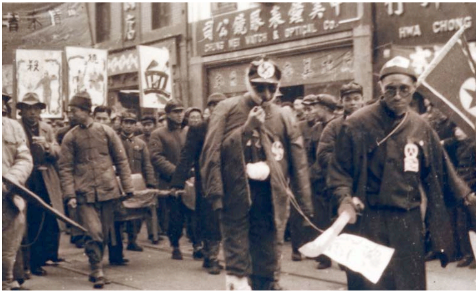
Figure 5: A huobaoju being performed on the streets of Shanghai, 1950. The actor in the centre of the image with sunglasses, pipe and bandages is playing the part of Douglas MacArthur; the actor holding a samurai sword and wearing a kimono is playing a Japanese militarist.

photographic record of performances suggests, for instance, that huobaoju had changed little between the 1940s and the 1960s. Actors portraying Americans and other ‘capitalists’ in 1965 dressed in much the same way as their predecessors had done in 1949 (or zhivaya gazeta actors had done in Moscow in the 1920s)—donning a top hat or MacArthuresque sunglasses (Hong, 2002: 159)—while the ubiquitous figure of Chiang Kai-shek continued to be depicted in Civil War mode (and in much the same way that illustrators such as Hua Junwu continued to draw him for the country’s newspapers), wearing an ‘ill-fitting army uniform and only a single boot’, with ‘hands bandaged and a plaster on his head’ (An, 1950: 1). 11 (Figure 5) While ‘living newspapers’ in China had thus been embellished with numerous vernacular cultural elements, they remained at heart a revolutionary form of agitational theatre, and one which continued to betray an early Soviet provenance.