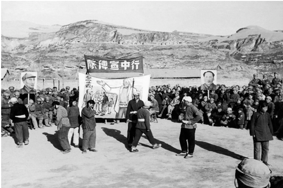
Figure 1: Agitprop theatre in the Communist base areas of northern China, January 1948. Note the almost complete absence of props, the minimal use of costume and the proximity of the audience to the actors.

is written for the special use of dramatic troupes within factories, villages, military units and schools. My aims in editing this volume are to introduce works that combine politics and art, and form and content, to my comrades amongst the workers, peasants and soldiers. At the same time, I hope that it can serve some level of educational purpose for the broad masses (Liu, 1951: no page numbers).